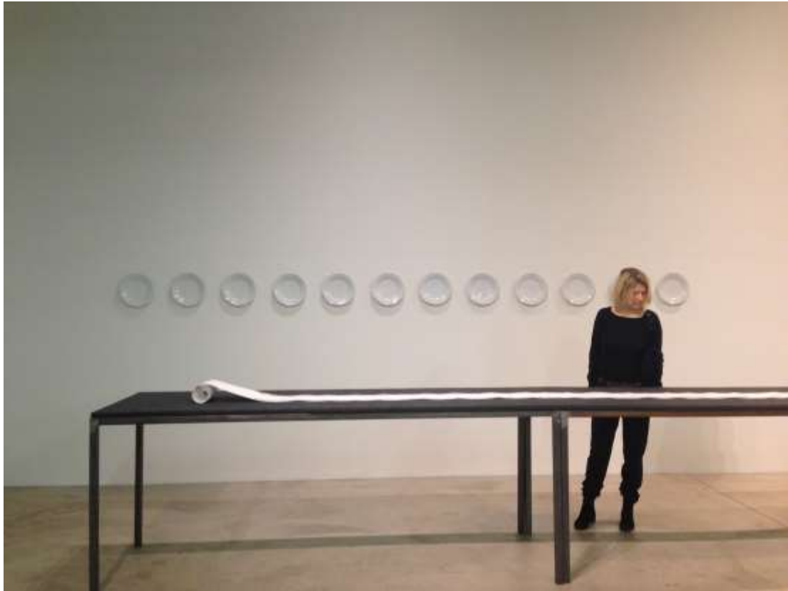
Installation view: From Alfred Street to Temple Street, Detroit , Chloë Brown, 2015 Exhibition: Dancing in the Boardroom , Museum of Contemporary Art Detroit (MOCAD), Jan-Apr 2016