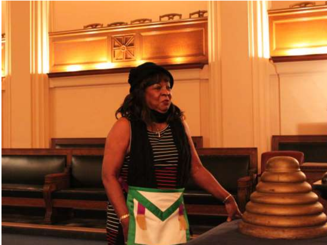
Martha Reeves delivering A Toast to Detroit

artefact this allows the work, and therefore the idea, and ultimately the voices of the women involved, to be disseminated to an audience outside the event itself. This LP will be pressed at Archer Records, the only remaining original record press in Detroit that once produced Motown and Northern Soul records.