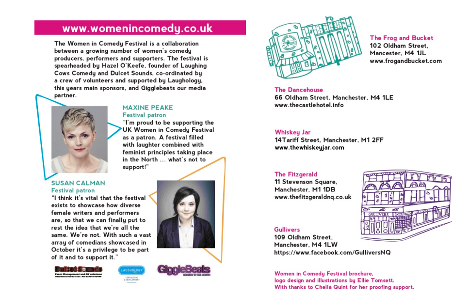
Figure 3: Example pages from 2015 brochure (patron page and venue information page)