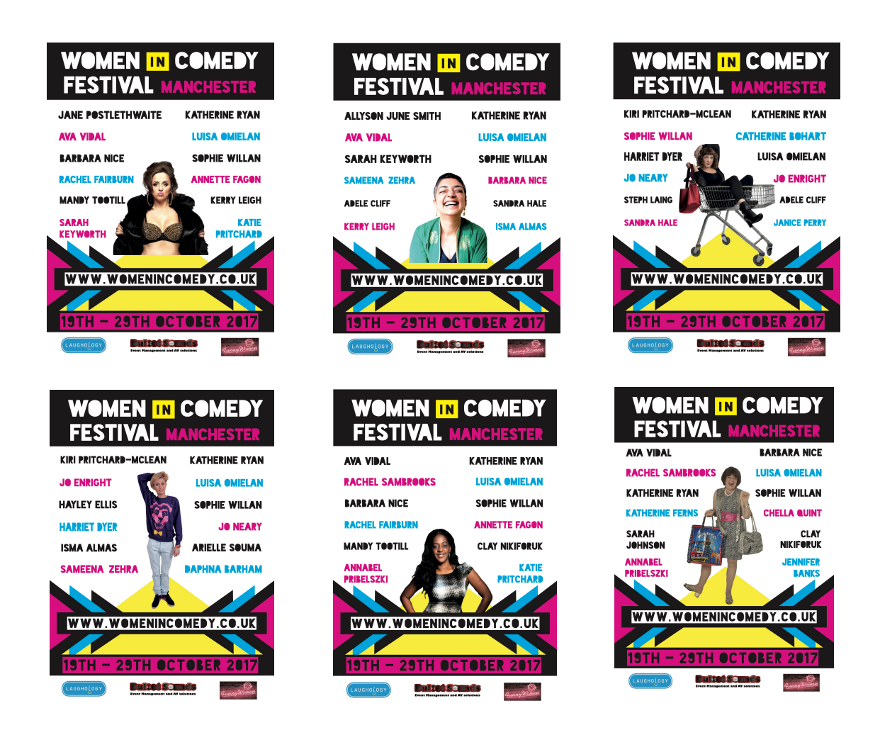
Figure 4: Poster series produced as part of the 2017 festival publicity.