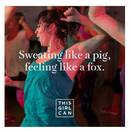
Figure 1: Image from This Girl Can campaign.

In addition to the imagery found in straightforward advertisements for the products of multinational companies we can also find similar techniques being deployed as part of behavioural change campaigns which are UK specific. Sport England's 'This Girl Can' promotions which seek to increase women's participation in sporting and fitness activities use a similar tone to that of the Always example. On the surface this campaign seems to have a very clear and admirable agenda – to get women to engage in sport and forget what they look like whilst doing it. However, the way in which this goal has been worked towards is a telling example of the conflicting messages that campaigns such as this send out to women. The advertisements themselves (deployed across social media, television and in print) are relatively simple: a picture of a woman or women doing some kind of sport with a white text slogan across the image and the 'This Girl Can' logo featured (see Fig 1.).<sup>9</sup>