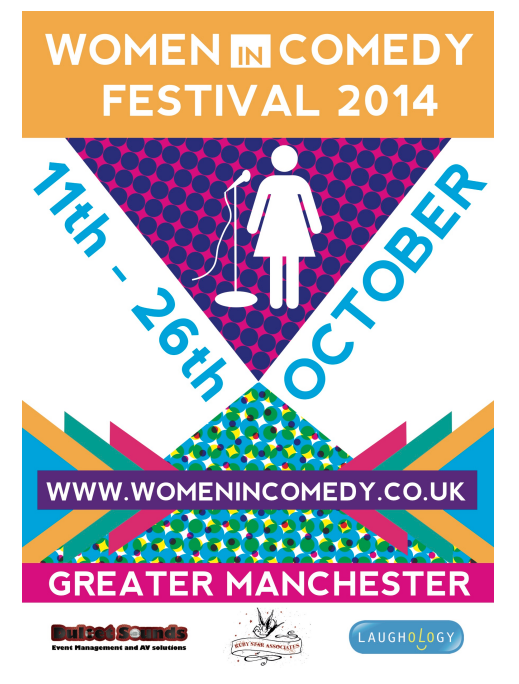
Figure 1: 2013 poster