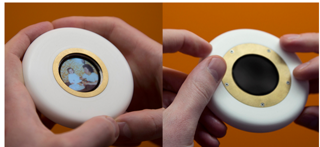
Figure 3. ReFind Artefact

The final piece, ReFind, (Figures 1, 3 and 4) measures 85mm x 14mm and is made from Corian, Brass, an Android smartwatch, crystal glass and tiny steel screws.