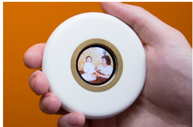
Figure 1. ReFind © Jayne Wallace.

mobile website, and by rotating the piece in their hands they will see five images selected from the archive of the deceased person, based on their semantic metadata.