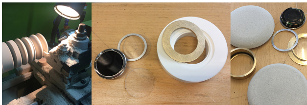
Figure 2. Design Development Components.

It is significant to mention that although we were clear that the first author was going to use the final design, we were not conceiving something bespoke for them. We wanted to make something that other people could also use and tailor to themselves within the life of the wider project. Our design process took an open, product design route, rather than a bespoke tailored one because of this.