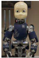
Fig. 1. Sheffield Robotics’ iCub

As our research platform, we used the iCub humanoid robot provided by Sheffield Robotics (Fig.1). iCub is one of the most advanced child-like robotics platforms available, featuring 41 actuated DOF and tendon-driven joints. Particularly important for this work are fully functional five-fingered hands, closely emulating the human hand. The setup comprised a legless iCub fixed on a platform, with a greenscreen board positioned in the background, in such a way that the board fully covered the field of view of iCub’s eye cameras looking directly forward. Gaze direction and head pose were fixed to minimise background variance. For image segmentation algorithm to produce a hand silhouette of good quality, illumination control, and uniform background are necessary. Green was chosen as the background colour because it is the most distinct from the colours of the robot's hand and its covers.