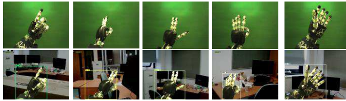
Fig. 2. iCub counting against a green background (top row). These images were used to produce the DNN model dataset (bottom row)

iCub was programmed to count from one to five using fingers on the left hand. From a range of different finger-counting styles representing numbers from one to five, we chose the American Sign Language, as being most convenient given specific hardware implementation of iCub’s hands (shared actuator for the ring and little fingers).