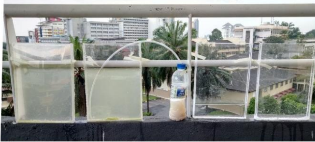
Figure 2. From the right is Panel A, Panel B, Panel D and Panel C