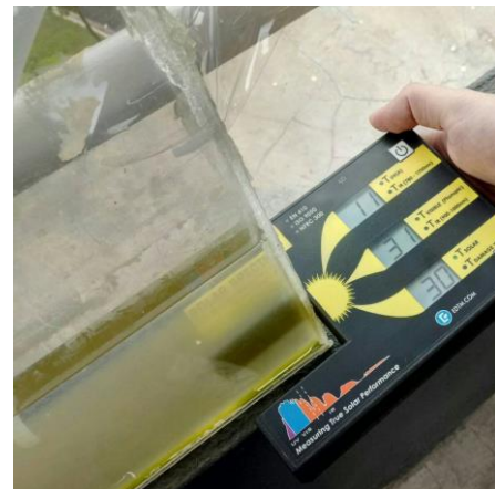
Figure 1. Readings taken using solar spectrum meter

Material needed to construct the basic flat panel PBRs for this experiment were acrylic panels, yeast, sea water, plastic tubes, and water bottles. In order to monitor the experiment, a solar transmission and power meter model SP2065 (to determine solar radiation) as well as a solar spectrum meter SS2450 to determine daylight transmission level (as shown in Figure 1) were used.