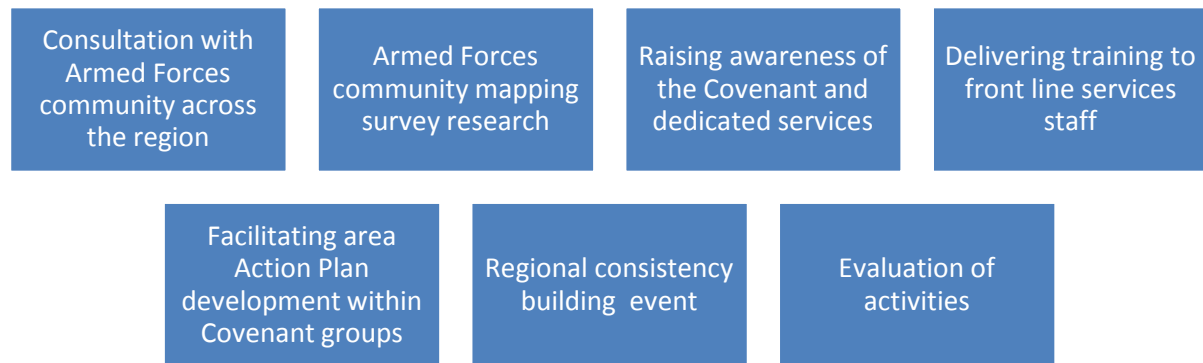
Figure 5.2: The South Yorkshire Armed Forces Covenant model: A regional community capacity building approach