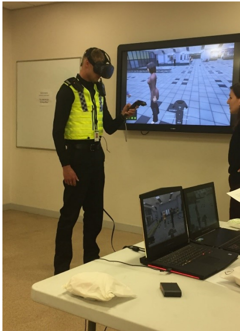
Figure 2- VR Training with AUGGMED

Each group was assigned their own assessor, with the assessor adopting the role of an employee in the scenario. They could disseminate additional information to the participants, if they were asked. This information was provided on an information sheet. If the information was not available, assessors would reply with "I'm not sure about that." The assessor was also responsible for providing a debrief to their group after training to ensure that any mistakes that were made during the training were identified and rectified.