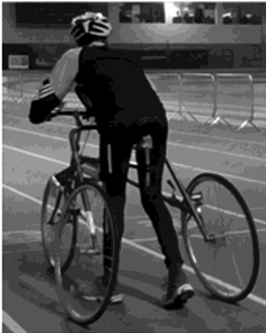
Figure 1 —A RaceRunning bike.

In addition to health-related benefits for people with neurological disorders, RaceRunning has become a competitive sport promoted internationally by the Cerebral Palsy (CP) International Sports and Recreation Association, formally structured in World and European competitions (World Para Athletics, 2016). However, few investigations currently exist on the mechanics of RaceRunning gait