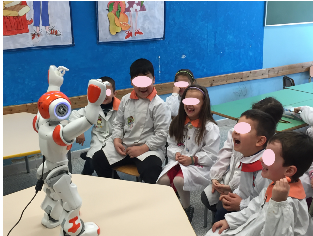
Figure 1. Robot expressive storytelling.

Specifically, the expressive condition was characterized by gestures of the hands, legs and trunk to accompany and mimic the objects and the adventures told in the tale. For example, in the knowledge tale Nao robot clapped his hands while saying “Oh! How beautiful are our Emperor’s new clothes! What a magnificent train there is to the mantle; and how gracefully the scarf hangs!”, and in the emotional tale case Nao robot bent its head down after saying at a lower pitch “Kill me! Said the poor creature”. Moreover, the robot’s eyes changed colour (green, red, blue or white) according to specific situations, e.g. red for danger, at the same time the voice modulated the pitch, the volume and the emphasis on the words spoken, e.g. a louder voice and higher pitch when introducing the Emperor.