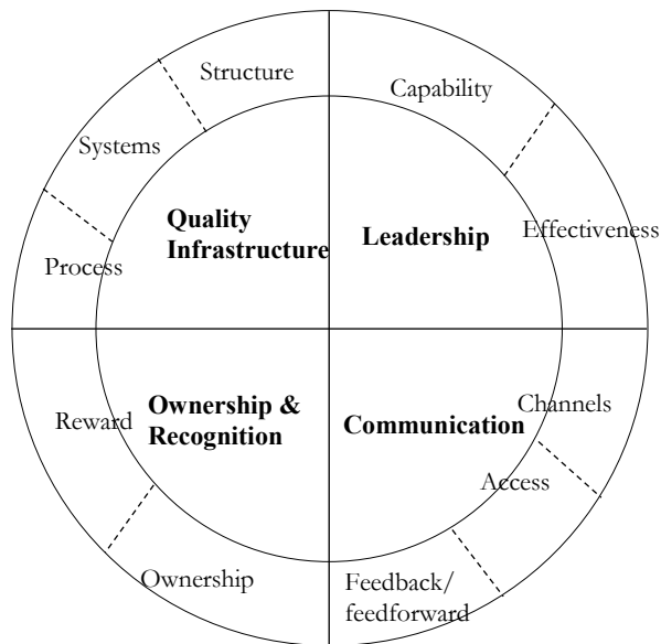
Figure 2 – Dimensions for building a quality culture in the student body

A model is proposed that unpacks each of the four domains into disparate dimensions which form the basis for building a quality culture in the student body. This model is adapted from Srinivasan &Kurey (2014). For illustration purposes, the domains and their dimensions are given in Figure 2. The four domains have a total of ten dimensions.