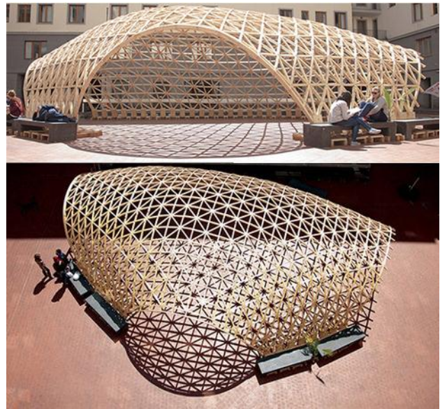
Fig.7. The Toledo Gridshell, Faculty of Architecture, Università degli Studi di Napoli Federico II, Naples[19].

The Toledo Gridshell designed, manufactured and assembled by a team coordinated by Sergio Pone [19] represents a good example of the contemporary approach to the design of timber gridshells. The structure has been designed for the courtyard of the Faculty of Architecture, Università degli Studi di Napoli Federico II in Naples. It is the last example of a set of gridshell structures designed and realised by the same team in the last five years and the arrival point of a design approach started with simple physical models and now supported by a refined digital tool compatible with the main 3D architectural and structural software.