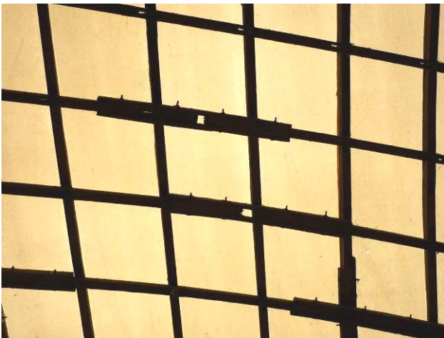
Fig. 2. Repaired breakage of lath – Mannheim Multihalle

As engineers for the gridshell, Ove Arup employed physical wire mesh models to simulate lifting of the grid by cranes. Their tests indicated that expensive 200-tonne capacity equipment would be required. Excessive cost, therefore, led to the adoption of the actual erection method - lifting of scaffolding towers with fork-lift trucks [2]. Several laths required repair due to breakage during the raising of the grid, see Fig. 2.