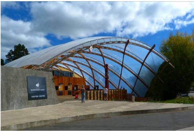
Fig. 6. Waitomo Glow-worm Caves Visitor Centre, gridshell of prebent laminated LVL laths on a 4.25 x 4.25m grid

The Waitomo Glow-worm Caves Visitor Centre, in Otorohanga, New Zealand, demonstrates the synergetic use of lightweight cladding, inflated ethylene tetra-fluoro-ethylene (ETFE) foil cushions, with lightweight structure, a widely-spaced (approximately 4.25 x 4.25m) lattice timber grid, Fig. 6. Here, laths were prefabricated from laminated veneer lumber (LVL) manufactured from Radiata pine and connected at the nodes using a single 20mm diameter bolt. Twenty-eight to 34 metre long double ribs, 324 mm deep overall with top and bottom layers connected by intermediate glue laminated block spacers, were fabricated in three sections joined on site with mechanical splices. Each 160 x 108mm lath was composed of three layers of 160 x 36mm (ex 170 x 39mm LVL) glulaminate to predetermined curve and twist to suit the toroidal geometry of the gridshell [17].