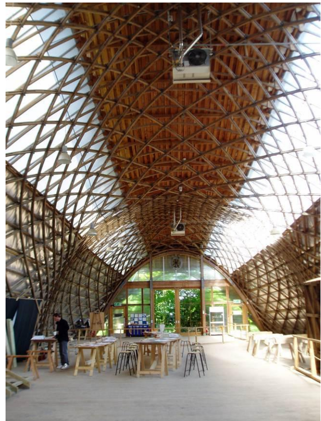
Fig.3. Weald and Downland Gridshell

Through competitive tender, the design and construction team evolved. The design team consisted of Glenn Howells Architects, Buro Happold as structural engineers and Green Oak Carpentry Company as carpenters for this project. A complex build, this construction fostered and benefitted from a close collaborative relationship between the consortium of experts. The Downland gridshell was widely described as having a triple bulb hour-glass shape open on both ends. On plan, the building measured 50 metres in length and 16m at the widest point narrowing down to 12.5m at the waists. It measured 7.35m in the lowest points and at the central bulb, the tallest point measured 9.5m [5].