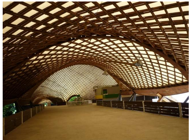
Fig. 1. Mannheim Multihalle