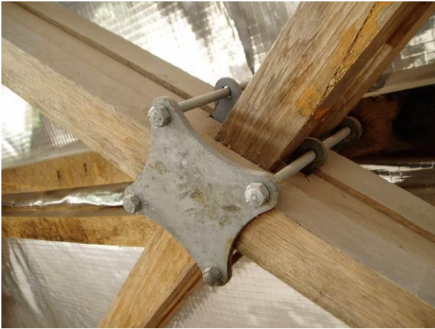
Fig. 4. Patented clamping system used in Weald and Downland Gridshell

Another innovation/improvement from the Mannheim Multihalle construction is the way the gridshell was constructed. By forming the gridmat at a higher level on a working platform, this allowed the timber to work with gravity by being dropped into their designed position.