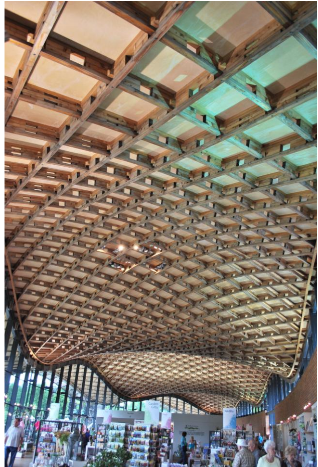
Fig. 5. The gridshell roof at The Savill Garden Gridshell seen from the inside

wide. The underside of the dramatic gridshell, displays a complex build up of timber and has been described by the architect Glenn Howells as "like a duvet being fluffed up"[7]. The shallow gridshell undulates to reflect the rolling hills of the Royal Landscape.