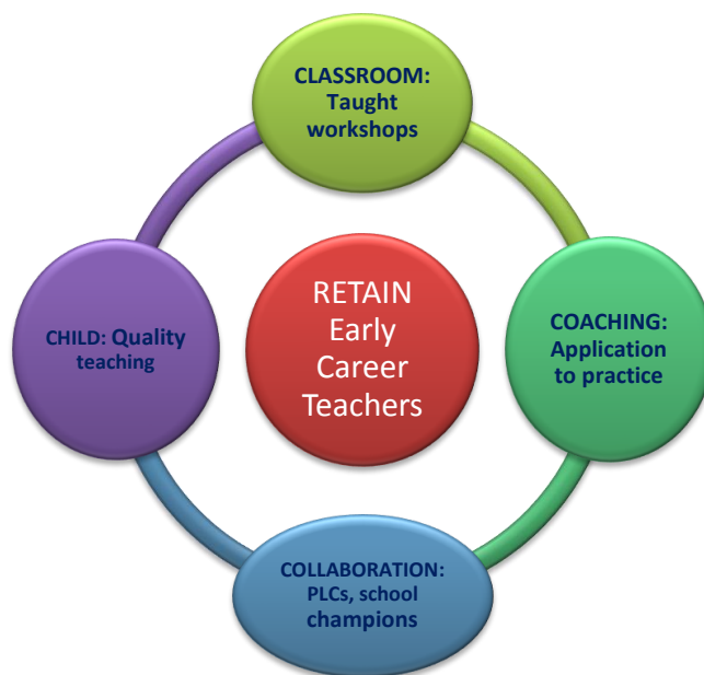
Diagram 1: The 'RETAIN': Early Career Teacher Retention Programme Model

The programme also aimed to improve pupil outcomes in Key Stage One literacy through a focus on developing the literacy pedagogy and practice of teachers involved in the programme.