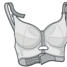
Figure 1 Diagrammatic presentation of the S4A bra.

A support bra (S4A bra) has been designed for women who have undergone wide local excision of a breast tumour and require a course of adjuvant radiotherapy. The bra is designed to lift and hold the breast away from the chest wall aiding treatment planning, and delivery while improving patient dignity. The primary endpoint was a support bra that is technically acceptable to health-care professionals (HCPs) and aesthetically acceptable to patients.