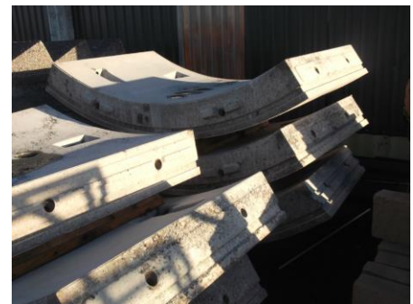
Figure 1 – Precast steel fibre reinforced AACM geopolymer concrete tunnel segments

In particular, new construction applications are detailed where a 25m long precast U-beam of similar design to those used at the Mersey Gateway project in the UK received anode installation in box-out and spray forms together with embedded performance monitoring tools to prove compliance with ISO EN 12696:2016 for long-term control of corrosion using ICCP. Data are provided that demonstrates control features and, from corrosion rate evaluation, to provide enhanced and measured performance for a projected service life of over 2000 years. Laboratory evaluation of bond between steel and concrete is used to corroborate this proof of enhanced and sustainable service life. Moreover a fire resistant tunnel ring of similar construction to those used at the Crossrail project in the UK was formed using steel fibre reinforced AACM geopolymer concrete in 6 segments (Figure 1) using industry standard precasting methodology is also discussed.