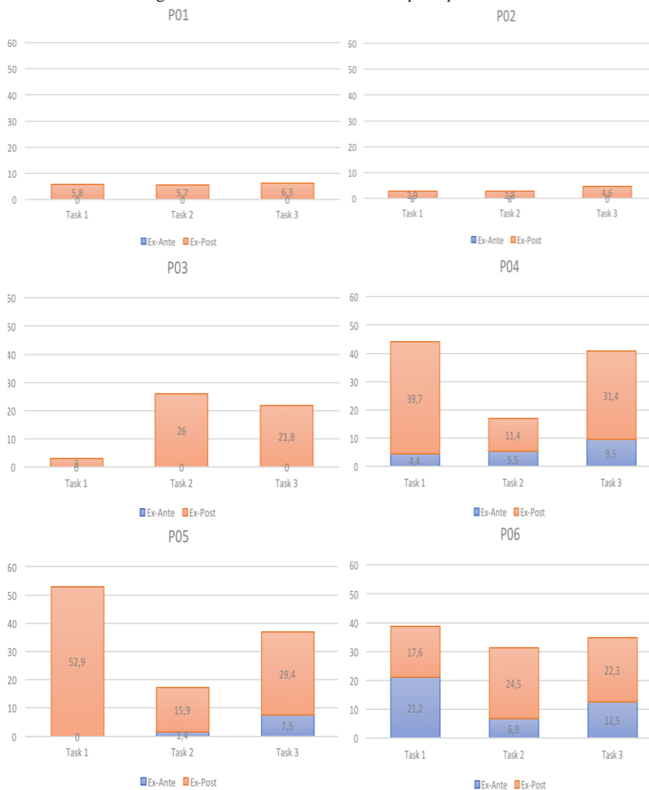
Fig. 4. Imitation time. The graphs show the percentage of time spent by each child (P01-06) in imitating the robot. Ex-ante is the result at the first encounter, before the robot-assisted training. Ex-post is the increase of imitation time at the end of the robot-assisted therapy.

In Figure 4, we report the comparison between the time spent by the children in imitating the robot movements in the first therapeutic session (Ex-ante) and the improvement shown after the robot-assisted training (Ex-post). In both cases, the children were interacting with the robot without educator prompts .