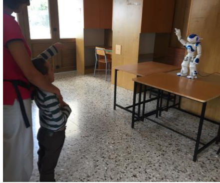
Fig. 3. An example of training with robot-assisted.

The robot addressed the child by his name to make the intervention more personalized. At the end of each session, the child was free to rest in an adjacent area in the room about for 1 minute.