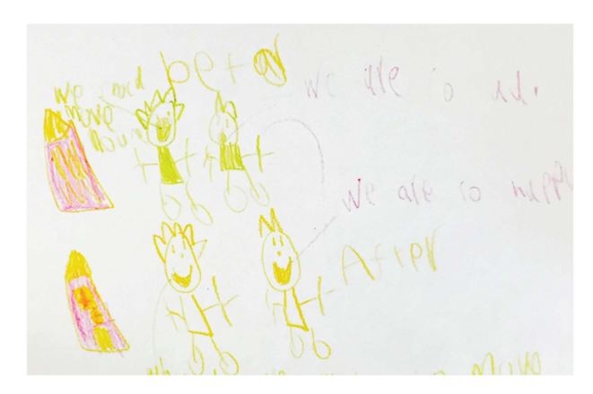
Figure 3 A picture showing the child's family before and after the intervention. In the before picture, the child has written by an image of his home 'we are so sad' and in the after picture the child has written 'we are so happy'.

perceived that being exposed to families with children affected by lifelimiting conditions would upset their children.