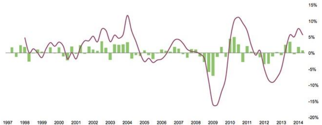
Figure 1 Example of ‘boom and slump’ pattern in UK construction industry – Quarterly and yearly rates of output change (ONS, 2014).

cash generating organisations as opposed to asset rich; one of the keys to business success is therefore managing workload and the associated revenues they generate during periods of fluctuation in workload. The study had identified reasons why workload in the construction industry is cyclical, it also identified that the industry typically follows a ‘boom and slump’ pattern, as opposed to gradual rises and falls, shown in Figure 1.