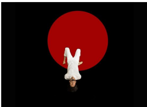
No Man's Land (Mohamad's Series)

https://www.facebook.com/events/320115955293474/?active_tab=about