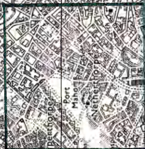
Map Showing The Kelvin / Thorpe & Greenhill / Bradway Areas