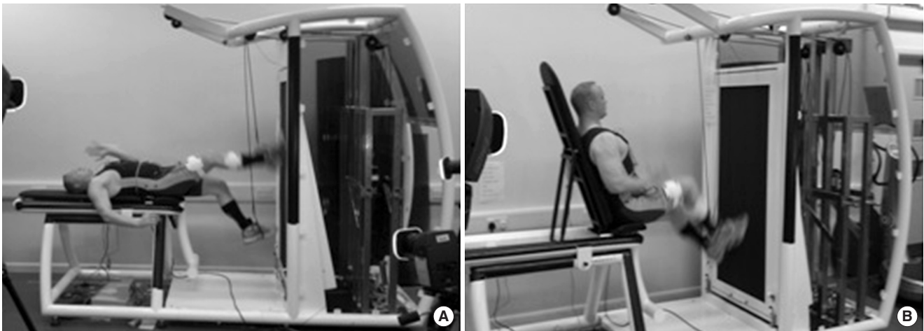
Fig. 1. The VertiRun being used in the supine posture (A) and 70° posture (B).

ing the bench angle and fore and aft settings. The overhanging cables are tethered to the ankle and offer resistance to the musculature of the posterior chain (20 N on the uptake of tension, up to 70 N as the leg descends to the lowest point of the treadmill). Therefore, the magnitude of the resistance is dependent on the leg length, leg mass and the lower limb range of motion of the user.