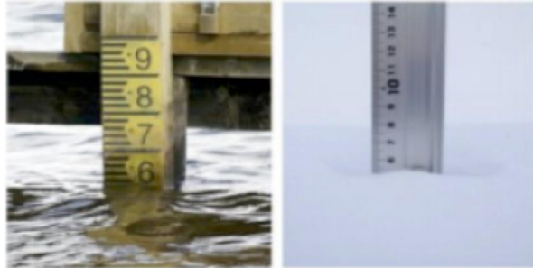
Figure 2: Examples of analog gauge boards