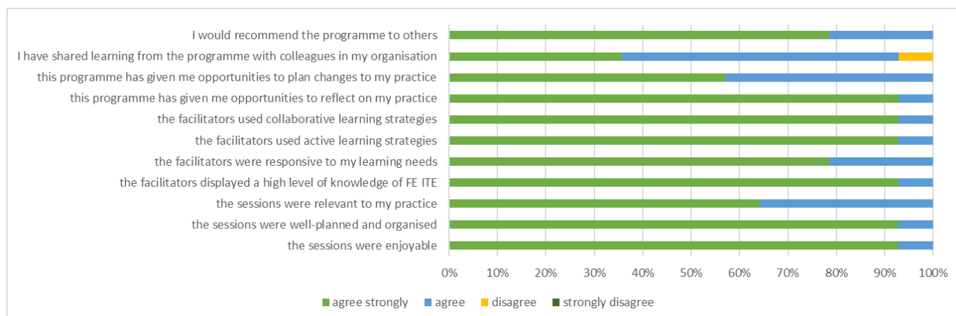
Figure 1. Participant experiences of the programme from post-course survey

The programme ran predominantly on Saturdays and this was commented on favourably by many participants. Not surprisingly, most positive responses here related to the lack of necessary commitment or input from the participants' organisation to sanction attendance on a Saturday as opposed to a weekday. Interestingly, though, there also appeared to be a feeling that attending on a Saturday was a sign of additional commitment by participants, and so they would behave accordingly, by ensuring that they gained as much as possible from the sessions.