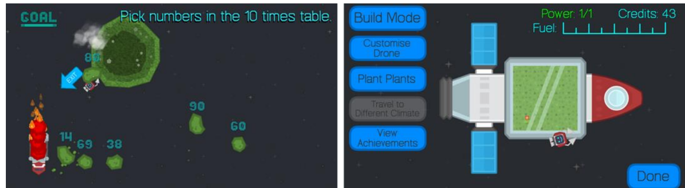
Figure 1: (left) The RAIDING game's core mathematical gameplay: mining rocks to earn currency. (right) The player's mothership which forms the basis of the (non-mathematical) meta-game.

The game's learner model drives the adaptive difficulty of the game in line with a chronometric model of learning focusing on reaction time [1]. The learner model begins empty, and only allows a restricted range of times tables tasks to be delivered. During play, the model records reaction time and outcomes for each task presented, maintaining a rolling average reaction time and accuracy score for each multiplier. As a player demonstrates mastery, the learner model unlocks a wider range of tables and reduces the frequency of the older ones. Mastery is determined by first demonstrating a high level of accuracy, then a response time of less than two seconds.