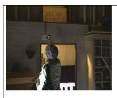
FIGURE 9. Vignette 5: "I Would like to Be Upstairs in Bed".

Anna chose the Bean An Tí as character of interest. On entering the Mountain Farmhouse, she notices the QR marker over the doorway into one of the bedrooms and scans the code.