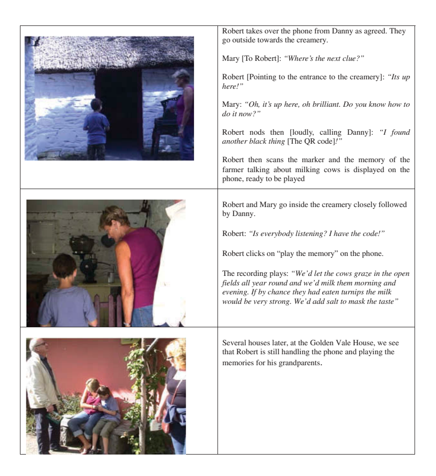
FIGURE 6. (Continued).

follow one character, rather than share one device and one character narrative between them (Figure 7).