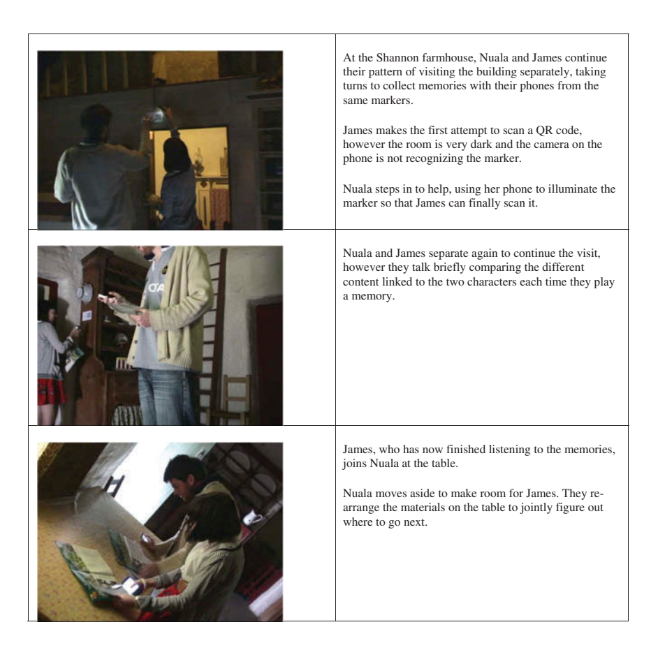
FIGURE 7. (Continued).

before. This seemed to be the case with other similar occurrences that we documented for other visiting units.