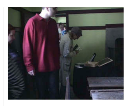
FIGURE 13. Vignette 8: "Is that the Mountain Farmhouse?".

Anna places one of the tangible tokens she has collected into the basket. A recording is then played of a male visitor's voice: