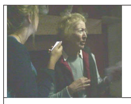
FIGURE 8. (Continued).

June [to Patricia]: "Were you ever in a bog?"