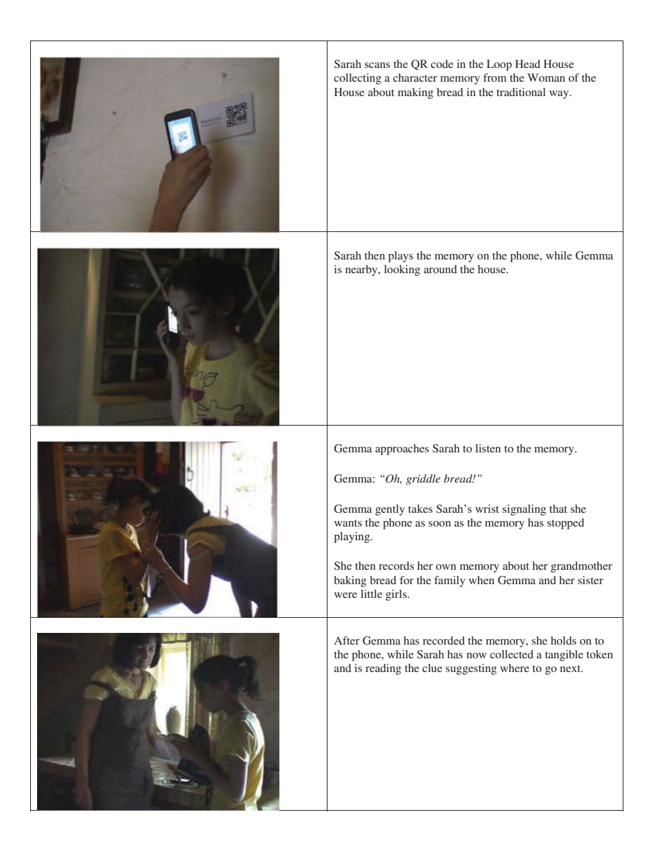
FIGURE 5. Vignette 1: Gemma and Sarah.

In both vignettes 1 and 2 we also see the assembly fully interfacing with the site, the buildings, the artifacts, and other resources that are part of the regular visit, such as, for instance, the map, which became seamlessly embedded in the interaction with Reminisce. In fact, we can say that the map became – for all intents and purposes – a part of the assembly for all the visitors, although it was