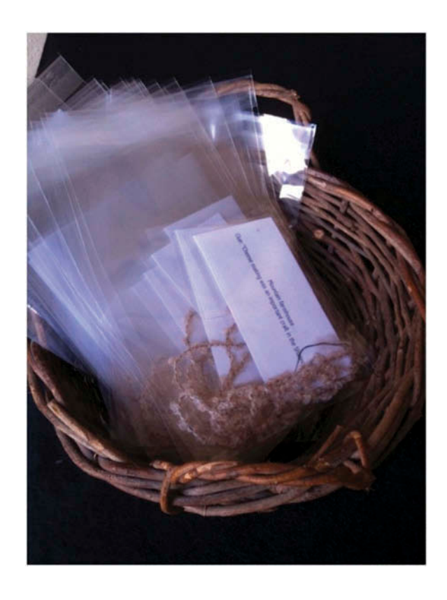
FIGURE 4. Example of Tangible Token: A Small Hank of Wool for the Shannon Farmhouse. Each Small Bag Contained an Artifact Connected to the House and a Clue.

At six of the memory sites (the exception being the schoolhouse), visitors could collect specially designed packs of tangible tokens (Figure 3, C; Figure 4), containing a souvenir that they could bring home with them and that was connected with each building (recipes, pieces of turf, small hunks of wool, etc.) and a clue about where they could find other memories. There were six souvenirs to collect in total throughout the experience and the souvenir packs were located at visible locations near the entrance to each cottage. The purpose of these packs was threefold: to provide the visitors with a memento of their visit to a building, to guide them to other memories