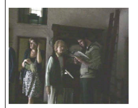
FIGURE 8. Vignette 4: "It Can't Be before the Famine".

June and Paul are trying to figure out in which period people lived in the Mountain Farmhouse.