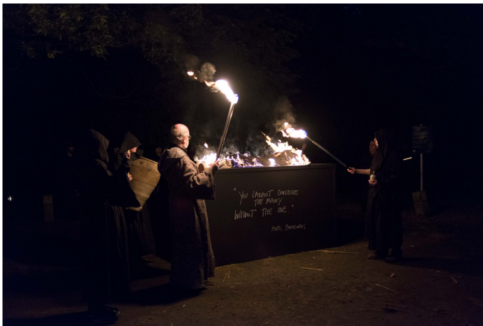
Liberalational Manoeuvre Sacrifice to Athena - Magick Lounge Club