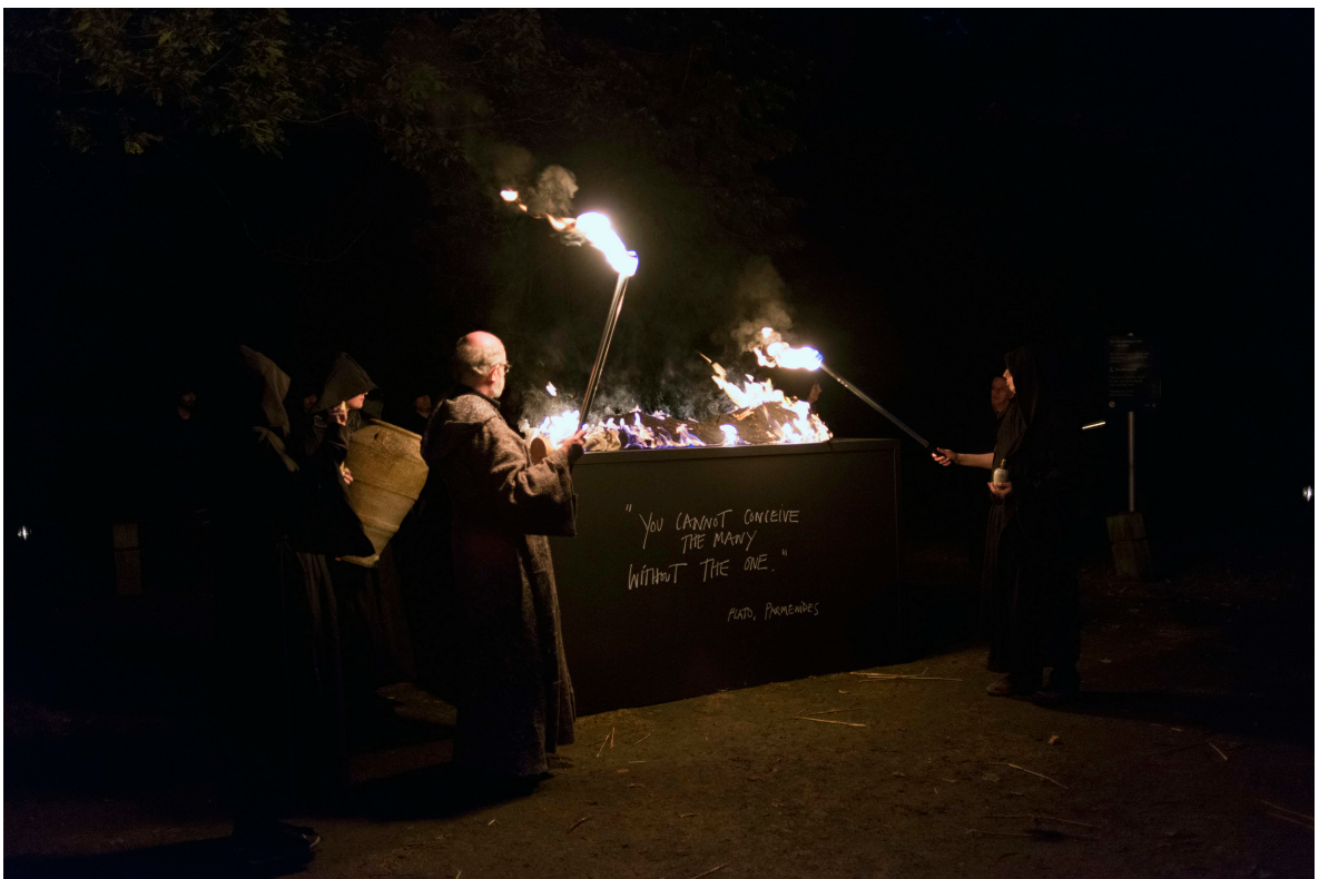
Ymedaca one day academy event August 2014 – Liberalational Manoeuvre of The Magick Club Lounge & Sacrifice to Athena