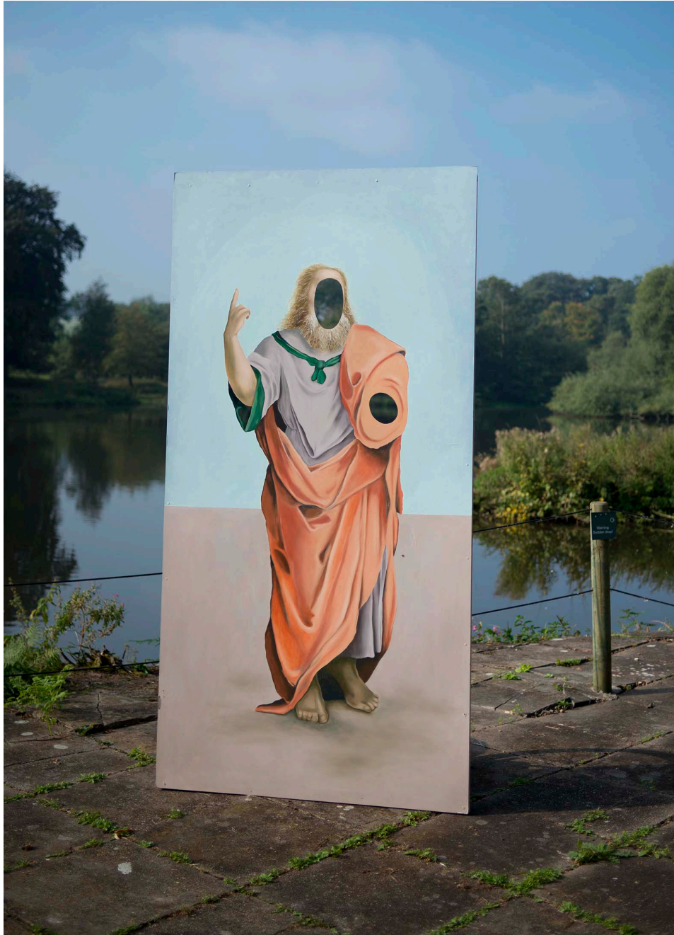
Ymedaca one day academy event August 2014 – Monument to Plato