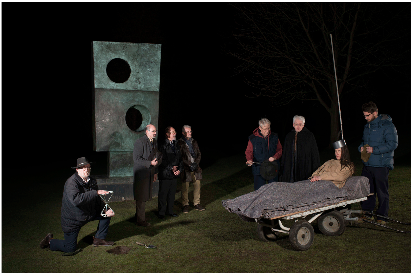
Ymedaca – The Game Plan (1 of 7)