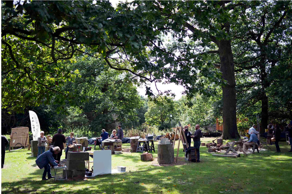
Ymedaca one day academy event August 2014 – Liberalational Manoeuvre - Hand Tool Users United & 'Practices to Transcend the Mundane'