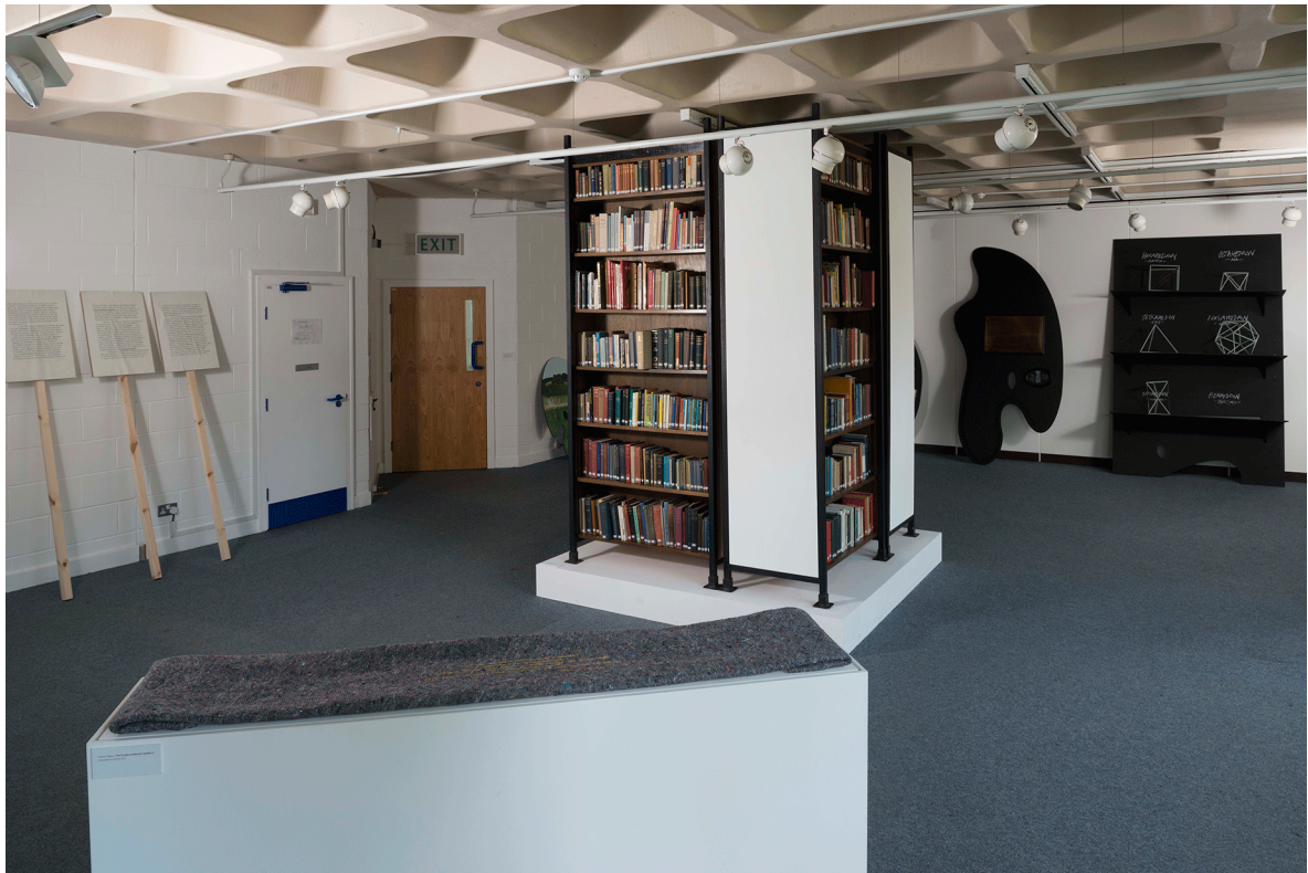
Temple of the Muses, exhibition at National Arts Education Archives Gallery, YSP: Installation shot