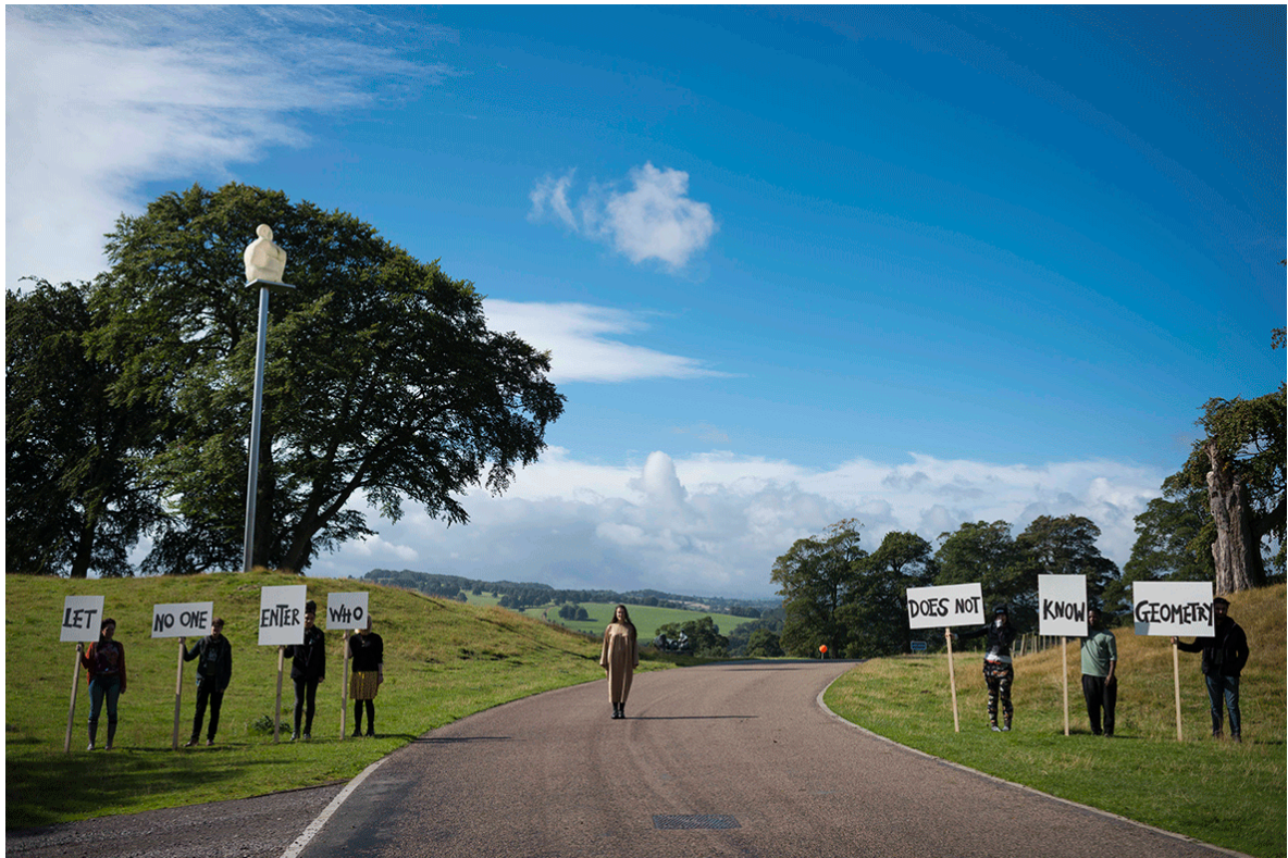
Ymedaca one day academy event August 2014 – The Archway Entrance