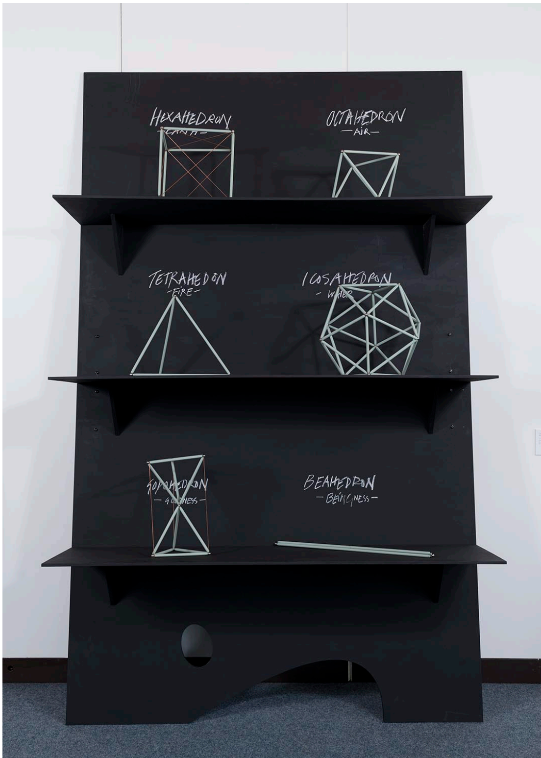
Temple of the Muses, exhibition at National Arts Education Archives Gallery, YSP: Palette Shield to Honour Plato