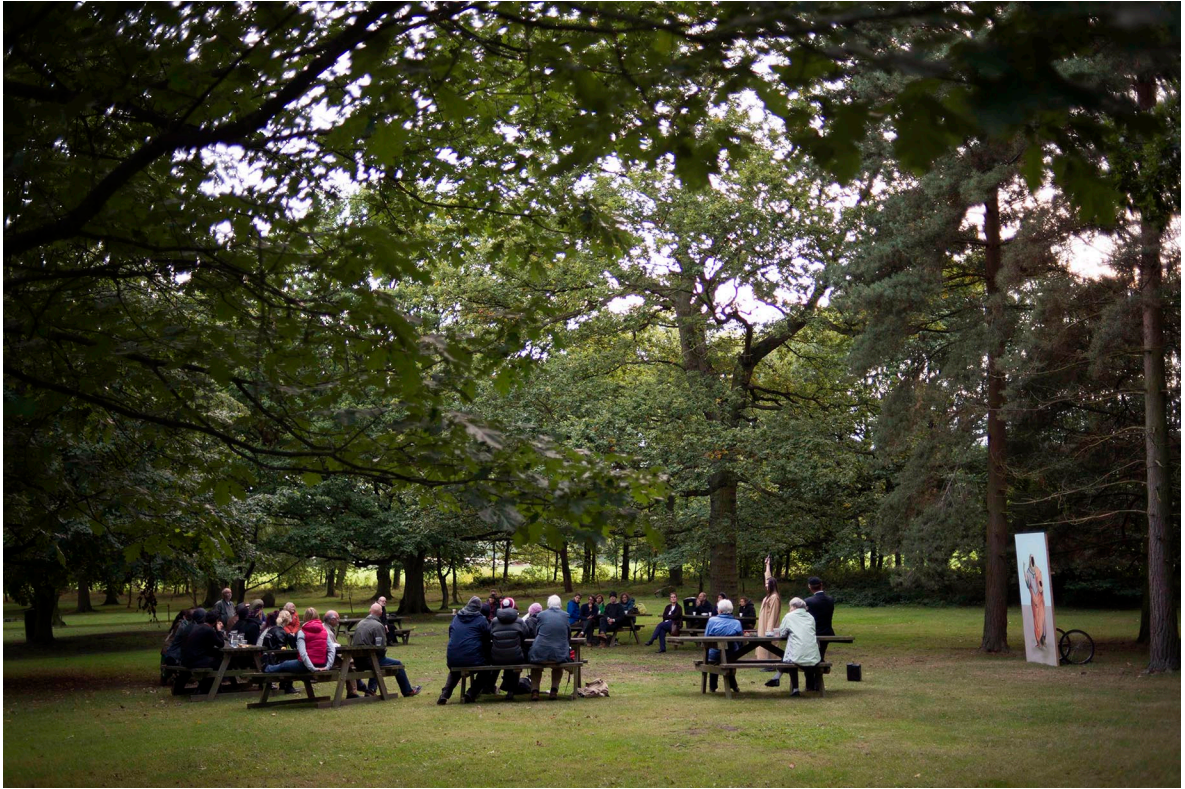
Ymedaca one day academy event August 2014 – Symposium