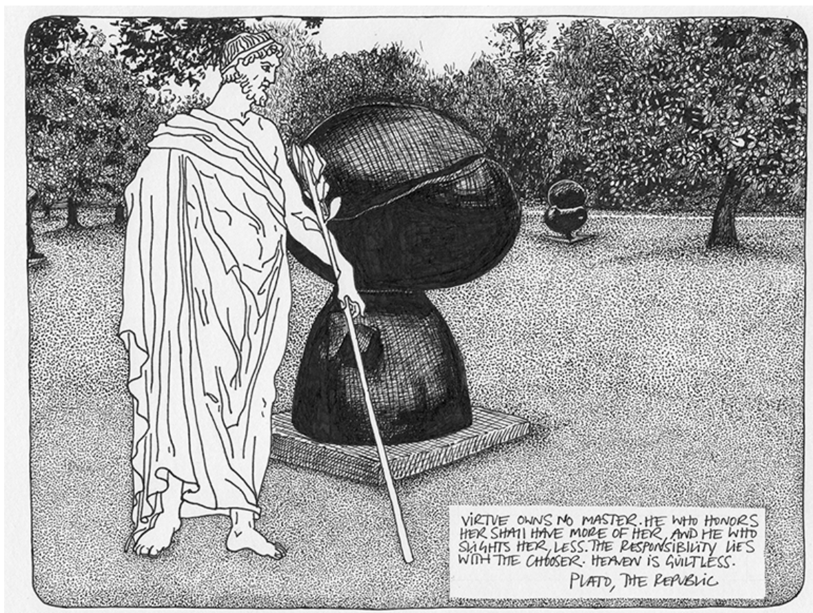
Plato at YSP – Cartoon 1 (of 5)