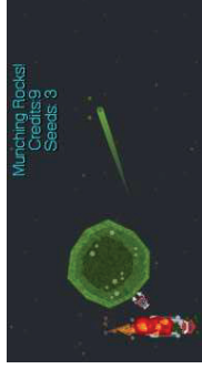
Figure 3: Conversion of credits and gaining seeds.