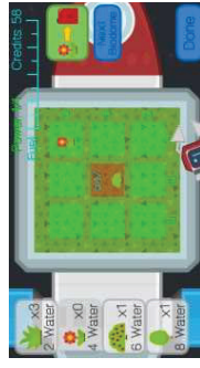
Figure 5: Planting in progress.