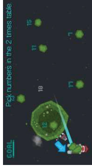
Figure 2: A times table mini-game.