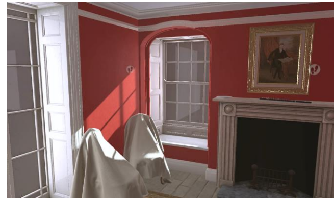
Figure 2: An EEN game set in the home of Edward Jenner.

As demonstrator for the REVEAL technologies, the Steel Minions studio is creating an EEN game based around the life of Edward Jenner, the Edwardian country doctor credited with the invention of vaccination [3]. The game is set within a reconstruction of his family home in Gloucestershire, England (now a museum) and explores the controversial aspects of Jenner's discovery (such as experimentation on children) as well as the classic story of smallpox, milkmaids and cowpox [16]. The final game will be published on the PlayStation Store as a digital product.