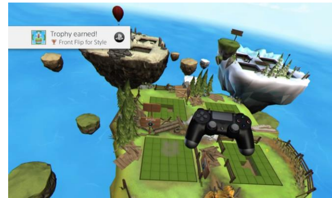
Figure 4: A virtual PlayStation controller in PieceFall VR (copyright Steel Minions).

To maximize accessibility, it was decided that all interactions in the game should be controlled by pressing any button on the controller. New users to PSVR (as expected in a museum context) would be unfamiliar with the controller layout and cannot see the controller with a headset on. Allowing players to press any button reduces the cognitive load associated with learning new control schemes. Some games introduce virtual controllers in line with research into physical VR interfaces [5] (see figure 4), but the team felt this was incongruous with the game's historical setting.