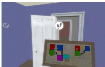
Figure 6: The node-based control technique trialed for REVEAL.

This project has received funding from the European Union's Horizon 2020 research and innovation programme under grant agreement No 732599