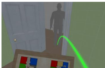
Figure 5: An arc-based control technique trialed for REVEAL.