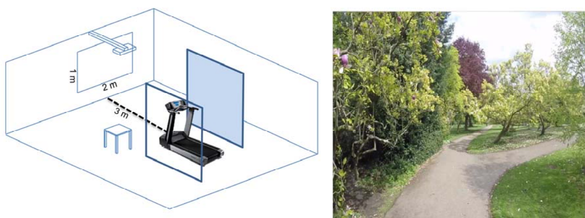
Figure 1. Left: The experimental setting, the treadmill is 3 m from the wall with projecting media and two partitions stand next to the treadmill [6]. The projected screen is 2 \times 1 m; Right: The one single frame from the dynamic image condition used throughout the whole twenty-minute.

consisted of self-selected, preferred entertainment where participants were able to choose preferences that included visual and/or auditory information. To focus on personal preferences of participants, there were no specific limitations imposed on the self-selected entertainment used for Gym exercise. Participants chose various entertainments, for example, listening to music ( N = 23 ), watching television (e.g., BBC news/talk shows) or movies (e.g., Simpsons) with sound ( N = 6 ) and viewing a picture (one person chose to view an image of friends). Television, movies and the static image of nature were presented on a wall-mounted monitor with a 2 \times 1 m screen, situated 3 m in front of the treadmill (Figure 1). Music was presented either from wall mounted speakers or through participants' own headphones. In each trial, participants performed a self-organised warm up for 5 min. The information panel on the treadmill was covered to ensure that participants were not able to view the distance of their run. The researcher was able to record these data by using the treadmill application program in a remote computer. There were two partitions on each side of the treadmill in order to control potential distractions by limiting participants' visible area to the forward plane.