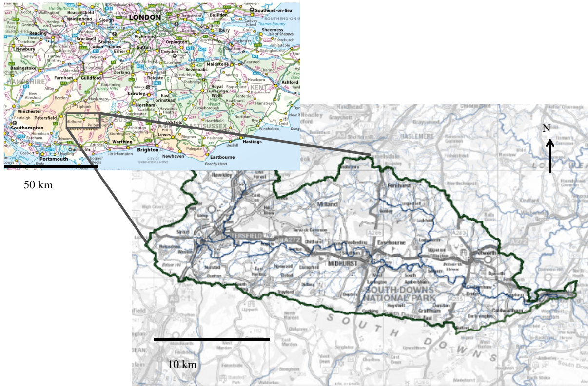
Figure 1. River Rother Catchment is located in the South Downs National Park with Midhurst at the centre (Edina Digimap, 2014; South Downs National Park Authority, 2015).

soil health. A reduced rate of water infiltration into the soil, or soil capping, increases the flashiness of surface runoff and increases sediment detachment and transport (Boardman and Favis-Mortlock, 2014). If the soil has a reduced infiltration capacity, excess water can create muddy flows that run across the land and into rivers, thereby increasing flood magnitude (Boardman and Favis-Mortlock, 2014).