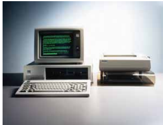
Figure 2. The IBM PC, 1981. The direct result of a vapourware proposal.

It was no secret that IBM was not the fastest in producing new products. In fact, the internal processes were so convoluted that it took three years to go from concept to production. Lowe knew