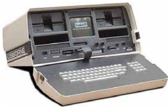
Figure 3. The Osborne 1, 1981. Closely based on a piece of vapourware.