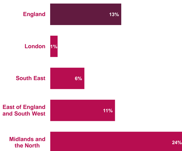
Figure 2: Proportion of housing association tenants who could afford RTB

The proportion of tenants who were assessed as being able to afford the RTB varied by region. For instance only one per cent of tenants in London were assessed as being able to take up the offer.