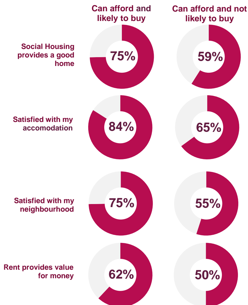
Figure 4: Attitudes toward social housing amongst tenants who can afford the RTB

It appears likely that views and opinions about the current home help to inform attitudes toward the RTB. Across the 35 questions that were assessed, tenants who were not likely to take up the RTB their current home were less positive about their home, their area and social housing (see Figure 4). It is not clear whether these tenants were exploring alternative routes into home ownership.