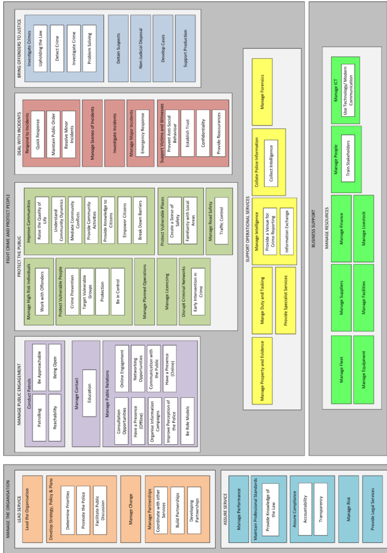
Fig. 2. Mapping of the Unity core tasks to the Police Activities Glossary