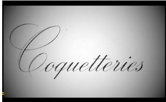
Coquetteries I-IV , 2013 Five short films