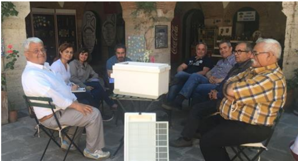
Image 1 - Meeting with Menemen Beekeepers

On the other hand, the beekeepers started to show interest in the possibility of a new project. Therefore, we decided to hold workshops for participants of both user groups. The beekeepers agreed to participate in the workshops.