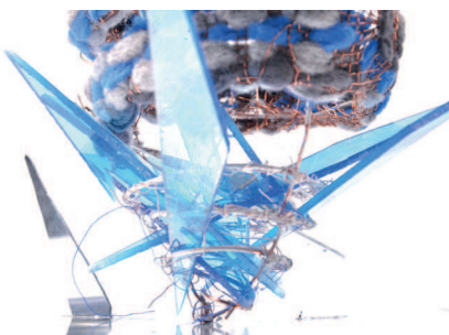
Difference & Repetition