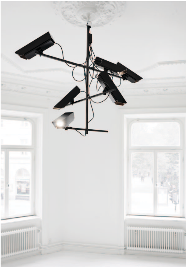
Humans since 1982, Surveillance Chandelier , 2011

Humans since 1982 have reworked the chandelier: theirs is equipped with surveillance cameras, offering an ironic take on the ubiquity of surveillance in our society.