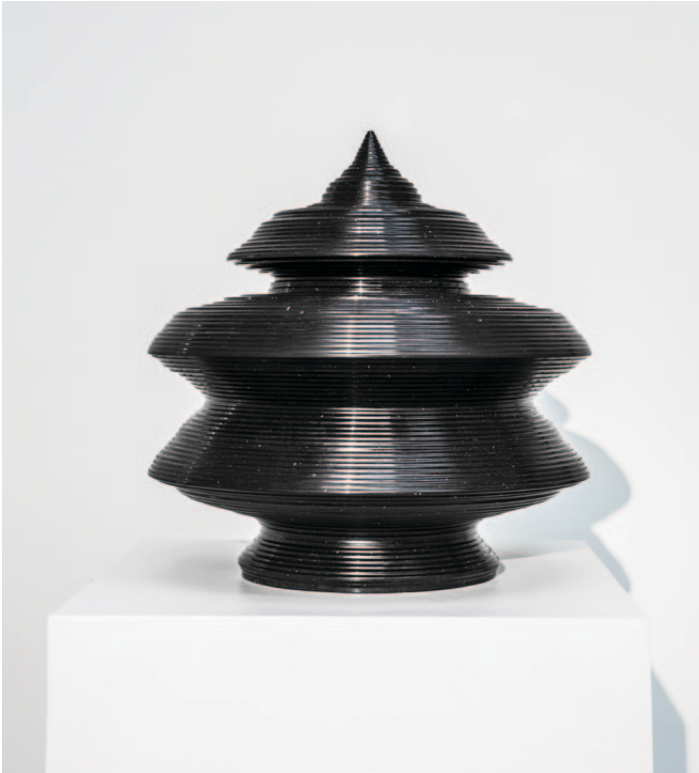
Mathieu Lehanneur, L'Âge du monde , 2013

Mathieu Lehanneur's L'Âge du monde is a series of sculptures that represent the population pyramids of various countries in three dimensions. The size of each of the approximately 100 strata indicates the number of people per age group. Taken together, they give a visual summary of life expectancy. Each vase has a unique shape depending on the country it represents.