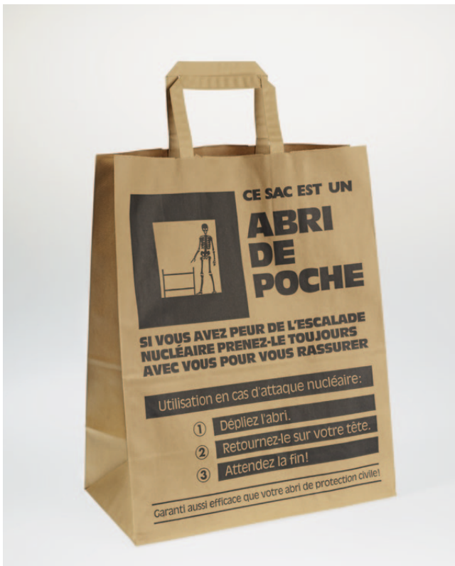
Abri de poche, 1983

Produced in 1983 by the Martin Luther King Centre in Lausanne during the nuclear arms race, this resolutely ironic bag gives instructions on what to do in case of a nuclear attack: "This bag is a pocket shelter – if you are afraid of nuclear weapons, then take the bag with you wherever you go – instructions in the event of a nuclear attack: 1 open the bag; 2 Put it over your head; 3 Wait for the end! – Guaranteed to be just as effective as your local bunker!"