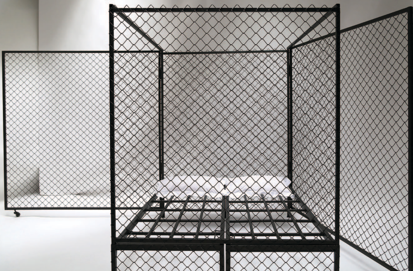
Dejana Kabiljo, Fences , 2014. © Kabiljo Inc., Photo: Dejana Kabiljo