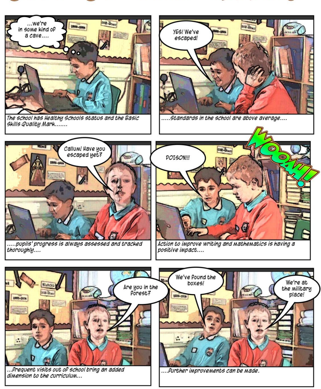
Figure 4: Out of the cave! Comic strip