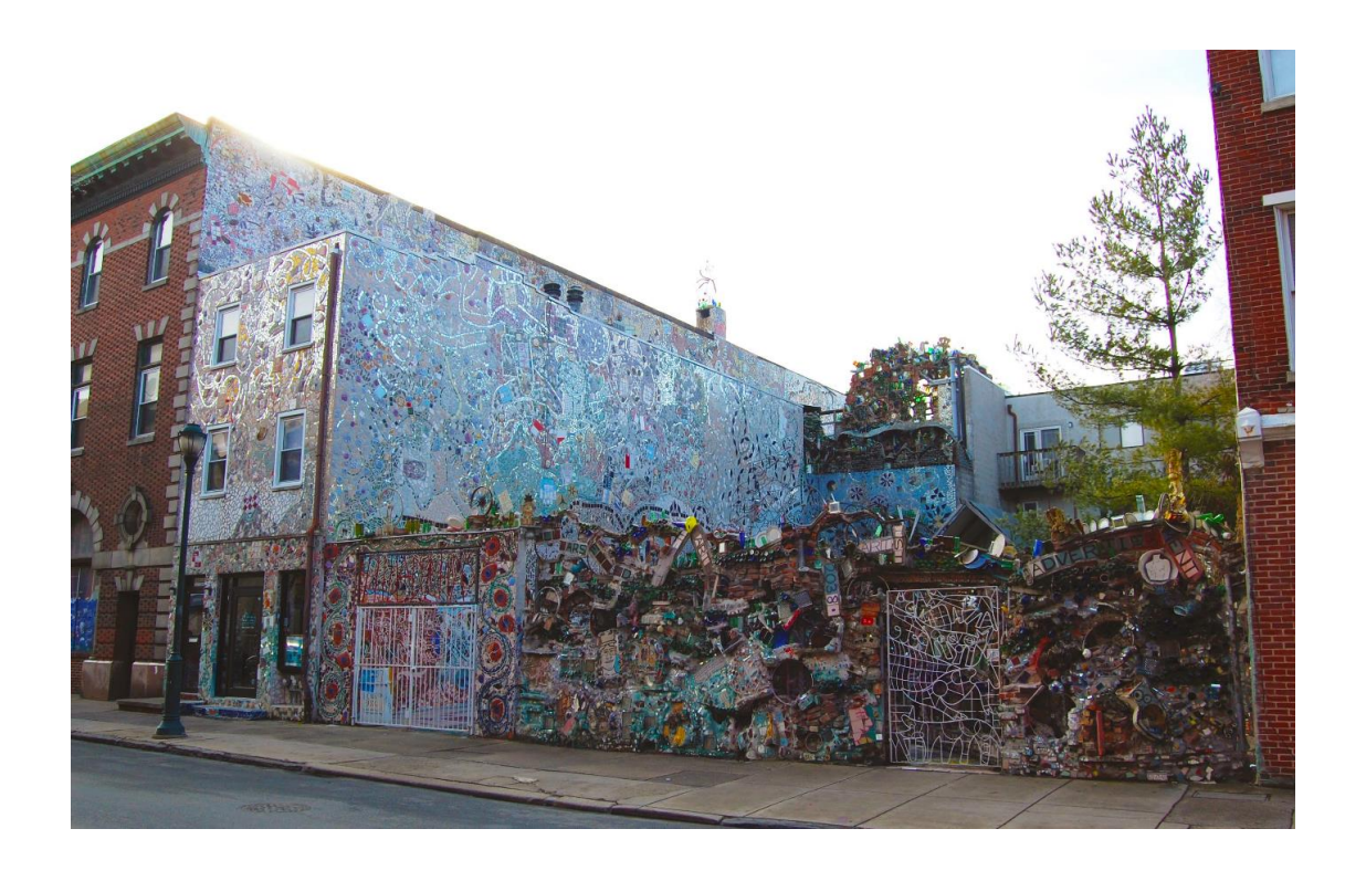
Figure 1: A view of the Magic Gardens, Philadelphia.

Returning later when the garden was open to visitors, Cathy explored the interior, the alcoves, precipices, passages and dead-ends embedded in the garden. As she wandered, perhaps momentarily part of the garden, she felt how the narrow pathways forced close encounters with intricate detailing that challenged what a wall, a divide, an environment can be, built from remnants and detritus from other times and spaces, assembling to generate something that was over-powering in the moment, but in which other ways of doing and being were immanent.