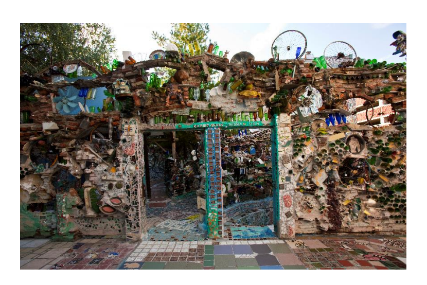
Figure 2: The Magic Gardens in detail.

We include this brief diversion to the Magic Gardens because of what happened afterwards. Enchanted by the Gardens we had been alert to its textures, its details, but more significantly to the feelings it evoked - to the interruption of affect. And moving on through the streets, we began to notice the textures, the details, the feeling of other buildings that we might have missed had the Magic Gardens not stopped us in our tracks. This experience, we suggest, hints at what a 'baroque sensibility' has to offer to literacy studies. It disrupts the idea of an all-seeing perspective prompting us not only to look but also to feel differently