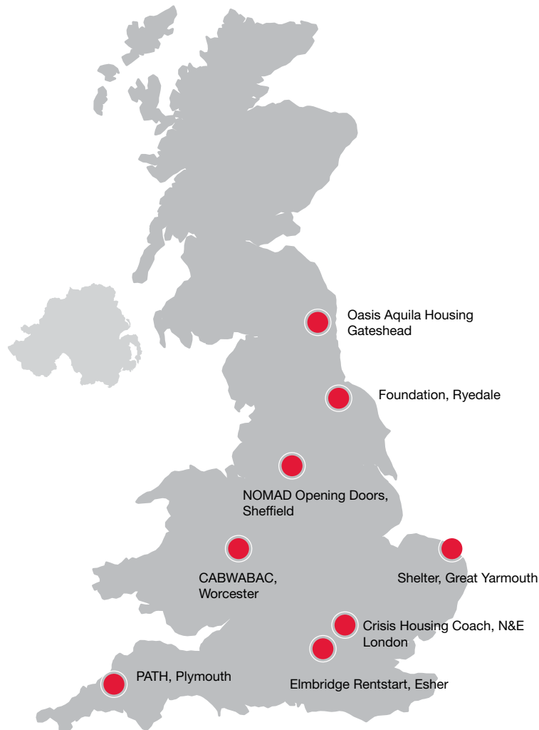
Figure 1.1: Geographical coverage of the Sharing Solutions programme