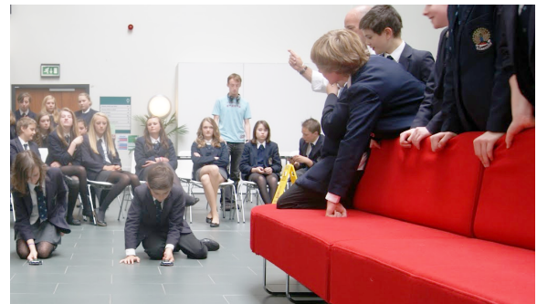
Figure 3: Robots at the Ready

as this minimises the frustration of having exciting tools but too many barriers to use them.