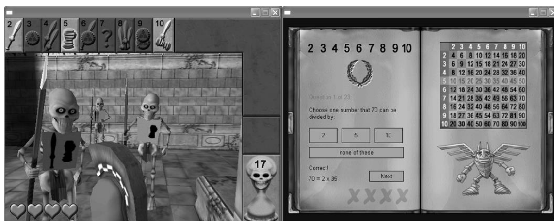
Figure 2: The extrinsic version of Zombie Division

In this way the intrinsic version of the game had a tight coupling between the gameplay and learning content where mathematical division was fundamental to the game's combat mechanic. The extrinsic version was exactly the same game but with the mathematical relationship removed from the combat mechanic. It then included identical mathematical content in the form of multiple choice questions at the end of each level (see figure 2). Both the intrinsic and extrinsic groups had access to the mathematical representation during the appropriate aspects of their respective games. The control version was the same as the extrinsic version without the multiple choice questions (i.e. no mathematical content at all).