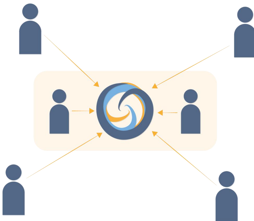
Figure 5 Cottage industry

Colleagues from our professional networks were invited to join the first iteration in January 2014. The BYOD4L team consisted of 10 facilitators and one artist from HEIs in the UK and Australia. A variety of job roles were represented: academic developers, learning technologists, researchers and lecturers. The collaboration among the team was informal and based on goodwill, professional trust and resembled a cottage industry (Figure 5).