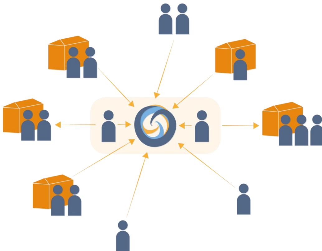
Figure 6 Scaling up

As there was also institutional interest to join BYOD4L as informal institutional partners, it was time to adjust the approach. Scaling up was needed to meet the demand and continue to provide an engaging and meaningful experience to participants and facilitators.