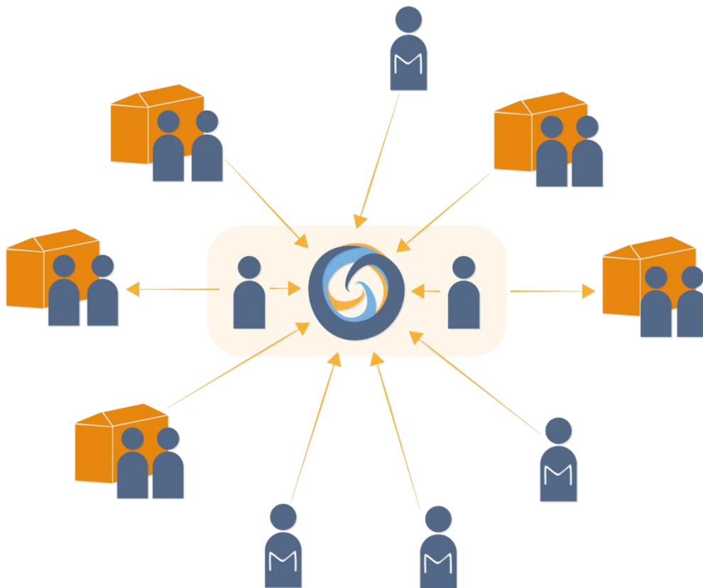
Figure 7 Strengthening the model

After July 2014, we reflected upon the experience and reviewed the approach again. This process helped refine the strategy for institutional engagement, facilitation and how scaling up could be further improved. It was decided that the facilitation team should be reduced and consist of just two facilitators from each participating institution. For the first time, student facilitators were identified and joined the team. Colleagues who were interested in supporting participants could join as mentors. Furthermore, facilitators would commit to facilitate throughout the week, while mentors would have a much lighter supporting role. These changes meant that the team was smaller and would grow in proportion with the number of participating institutions. The roles of the facilitator and mentor were redefined and clarified.