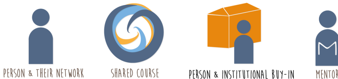
Figure 4 Key

Previous experience of collaborative open course design, practice and research in the context of informal cross-institutional collaboration (Nerantzi, 2014a; Nerantzi, 2014b) became the starting point of new thinking that emerged to maximise sharing of resources and expertise, provide choice and enrich exchanges and collaborations beyond institutional walled gardens. Collaborative and enquiry-based pedagogies informed the design. BYOD4L was peer reviewed to assure quality and help gain valuable feedback prior to the start date. Facilitators were also invited to comment. The small unit of makers was helpful in coming to agreements quickly, thereby proactively co-developing the course, activities and resources.