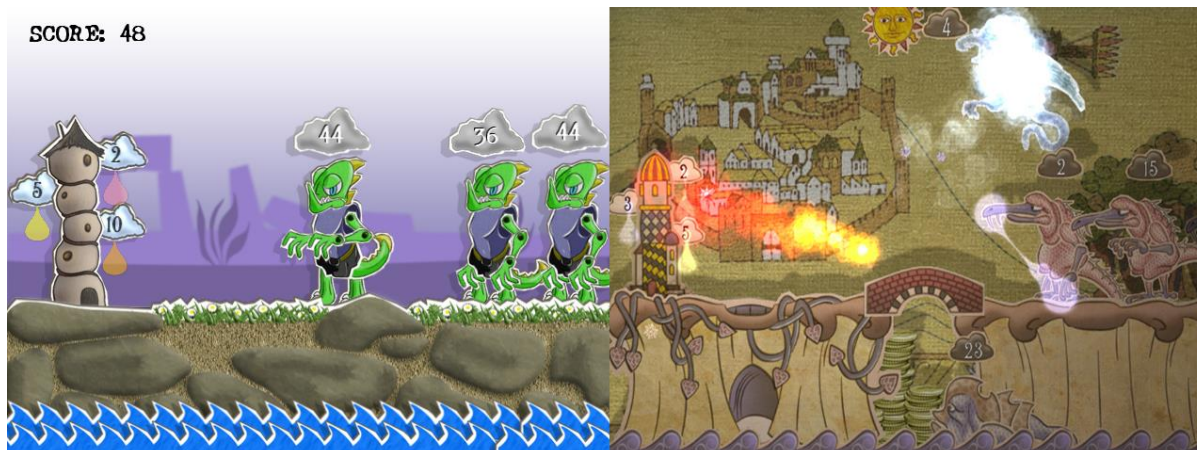
Figure 2: Outnum3r3d Prototypes. GameMaker (left) and Nintendo Wii (right)

The remaining design elements introduced repeated addition and multiplication as means of creating monsters to defend the castle in a similar vein. This meant that addition, subtraction, multiplication and division were all embodied as part of the game's core mechanics. Players could now combine mathematical strategies in order to dispatch enemies in different ways, resulting in different levels of tactical gameplay dependent on the player's conceptual understanding of division (i.e. being able to identify appropriate multiples of the available divisors). The final feature which was added to the game was an octopus-like end of level boss whose tentacles were all prime numbers which (therefore) couldn't be defeated using division attacks.