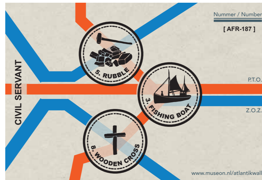
3. Printed card example

This design concept title "lines" uses the visual of crossing lines representing both the wall and lives of people around it. The concept seeks to connect the wall represented by the orange lines with the blue lines representing people's lives connecting with or intersecting with the wall. The design draws some aesthetic from aerial images from the archive of the city to give cohesion as the exhibition features much content based around maps and aerial photographs.