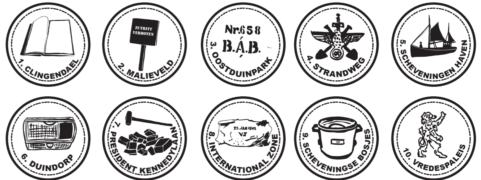
4. Stamps for thermal print