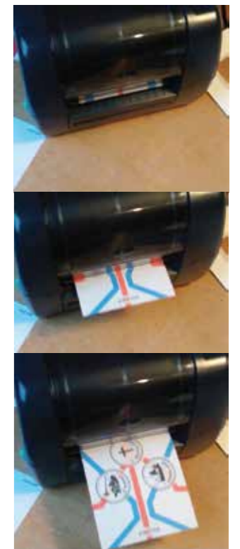
5. Thermal printing overlay

At the end of the visitor's visit they choose to "check out" at which point a souvenir is generated and printed based on the log data. The printing uses a thermal printer for speed and efficiency, once the visitor checks out a card is printed in a couple of seconds. The robustness of the thermal printer was necessary to give confidence to the museum and also to lessen the amount of time staff have to tend to the machine.