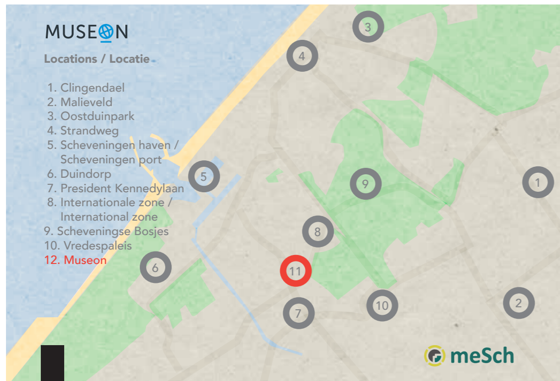
2. Souvenir postcard (Back)