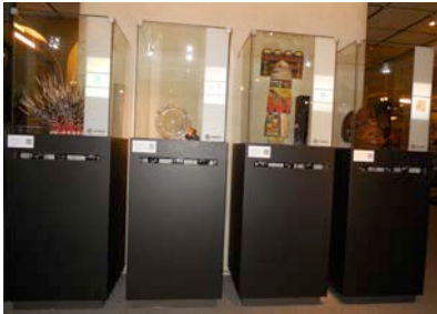
Figure 5. The four cases as installed in MUSEON.