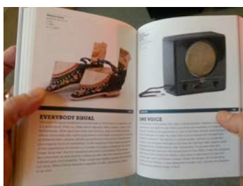
Figure 3. The extended catalogue of objects stored in MUSEON's deposits. The Chinese shoes and the Nazi radio were both used.

visitors would not know of the competition unless they have read the poster or a flyer; we considered the natural behaviour of visitors to be enough at this stage.