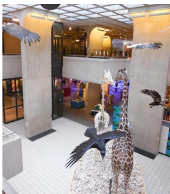
Figure 2. MUSEON exhibition floors. The picture is taken from the landing on the first floor (permanent collection). The cases are across the hall against the pillar.