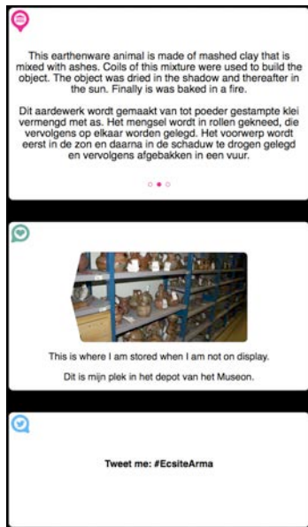
Figure 7. An example of the content projected on the case front glass.

exploration of Twitter on the exhibit floor brings disappointing results. Very few tweets were sent to the cases. We are inclined to believe this is due to the cases being in an unsuitable position (not a high-traffic area) and at an ill time in the visit: sending a tweet would require visitors to take their phone out and so, actually, would interrupt the visit. We speculate that a positioning where there is high traffic and people are killing time, such as the museum cafe or the entrance hall, could give much better results. The experts in MUSEON are also convinced the cases could be an excellent way to attract interest to the museum if they are placed in a different location, such as a station or the city hall. This last option is currently being explored for some of the objects in the deposits for which there is more than one exemplar and are less fragile. We can speculate that in that very different context the humorous aspect of the interaction and the potential high contribution of other viewers could make the cases provocative and memorable.