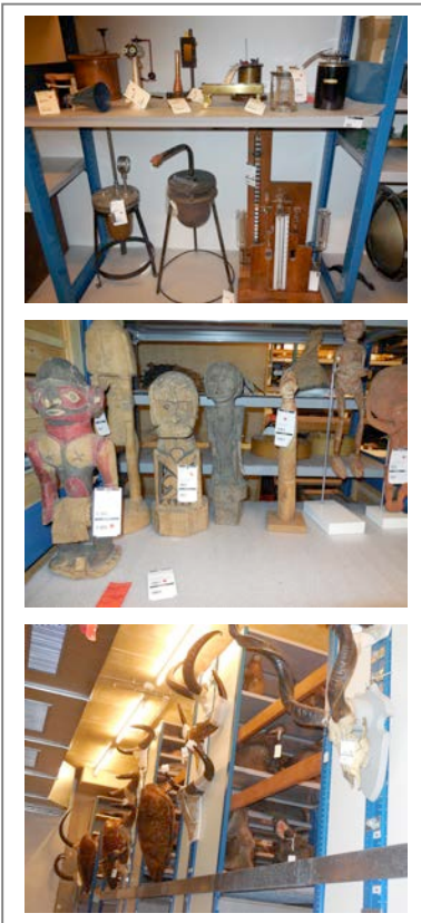
Figure 1. Images of MUSEON deposits show examples of the extended and eclectic collection.

engage the visitors in other ways than simply as receivers of information and appeal to the sensorial aspects of visiting a museum [3]; [5] set up an interactive home-like study where visitors can explore possible stories of unknown museum objects and leave their interpretations; [2] invites visitors to take physical objects from one place to another within an open air museum and use this as a mechanism to reveal content and invite group discussion; 0 reveals the under-layers of a painting only if multiple visitors stand in front of it, fostering a form of collaboration among strangers; [6] provokes visitors to look at and act around sculptures in a sculpture garden.