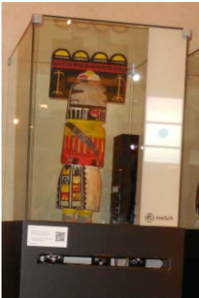
Figure 6. A close up of a case. The tower hosts the projector and the NFC reader/card-pocket; the slit shows the proximity sensors.

possible uses within their own museums. They appreciated the fresh and novel approach that attempts to take the exhibits closer to the visitors by talking directly to them (via the object's life) as opposed to the standard museum label. The idea of exhibits with personality was particularly well received by curators of challenging collections, such as human remains from the same place but from different ages and different social settings. In this case the first person speech and the characterisation would work very well to bring the story of those people from different times and different social classes alive for the visitors to enjoy.