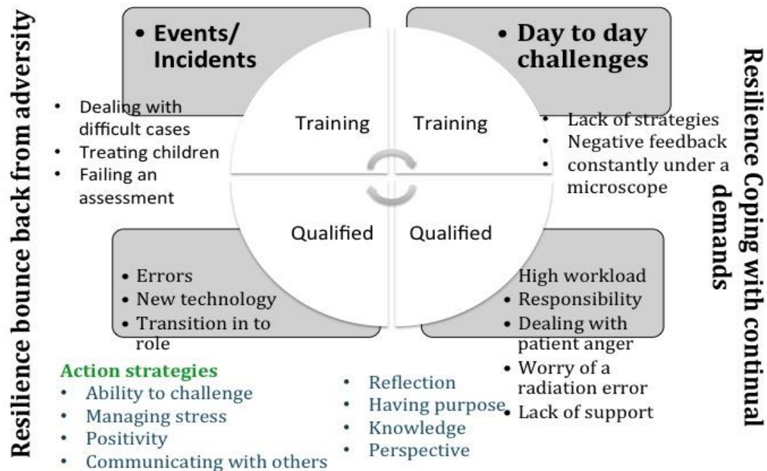
Figure 2 A proposed model of professional resilience

Across all data collection modes the clinical placement experiences for students was identified as an area where resilience was stretched but also developed. As the clinical placement experience has been identified in the UK as an area potentially of critical importance to student attrition rates(8) it is an area that needs future focus. Educators and placement staff alike need to look at the placement experience and look at ways of enhancing resilient strategies prior to the student's first clinical placement and then on-going support to enhance resilience as experiences develop throughout the course in preparation for professional life; we have listed in the section below what educational curricula may require for this purpose. This is supported by evidence in the literature as reported in the review by McAllister and McKinnon(24). However, while much work can be undertaken in preparing the students to be more resilient it is also important that individual departments or individual practitioners acknowledge the impact they can have on a student's ability to be resilient. For example, there were a number of occasions throughout the study that referenced how comments from staff 'shattered' confidence, or how individuals felt 'crushed' by comments made by staff when they were students. While McAllister and McKinnon(24) acknowledge the need for professional cultural generativity their recommendations focus on utilising resilient practitioners as positive role models or