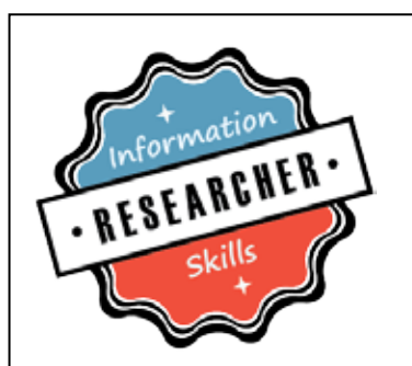
Figure 2. Example of a badge for achieving development through a particular co-curricular activity

specific skill (Figure 2), or participation in specific activities. This is conceptually equivalent to the badges earned and worn by members of the international Scout Movement where a badge is a visual indicator that the holder has demonstrated knowledge, skills or experience that meets a set of defined, common criteria 7 . A significant difference, however, is that Open Badges contain information about the recipient, the issuer, the time of the award and, optionally, evidence for the award. For example, a badge issued by a rugby club to recognise a person's involvement as a coach for junior players might include a link to a video of a coaching session or testimonials from supervisors and players. Therefore, these features provide advantages over traditional methods of recognising achievement and participation by allowing interested parties to see the criteria for receiving a badge and verify that the badge was genuinely awarded to the person by the stated organisation.