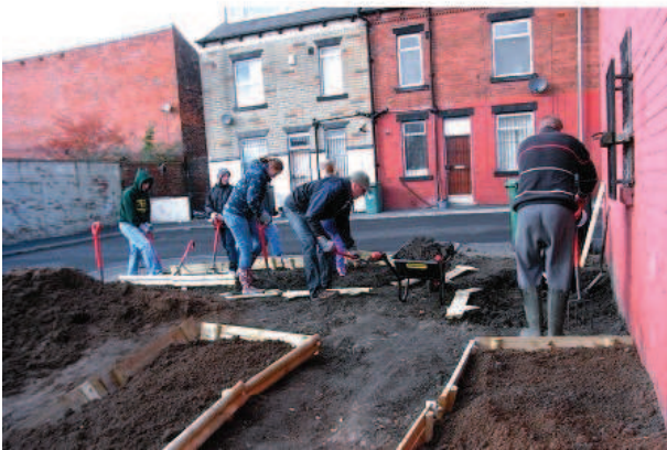
Figure 2: The community garden site before and during the event.

During the three days of the event, the planning team brought in members of the residents group to help with the work and activity in the space also attracted the attention of passing local residents who then became involved. The space provided a highly visible stage-like space, as it was located directly behind a busy parade of shops and a doctors surgery, and was surrounded by roads on three sides.