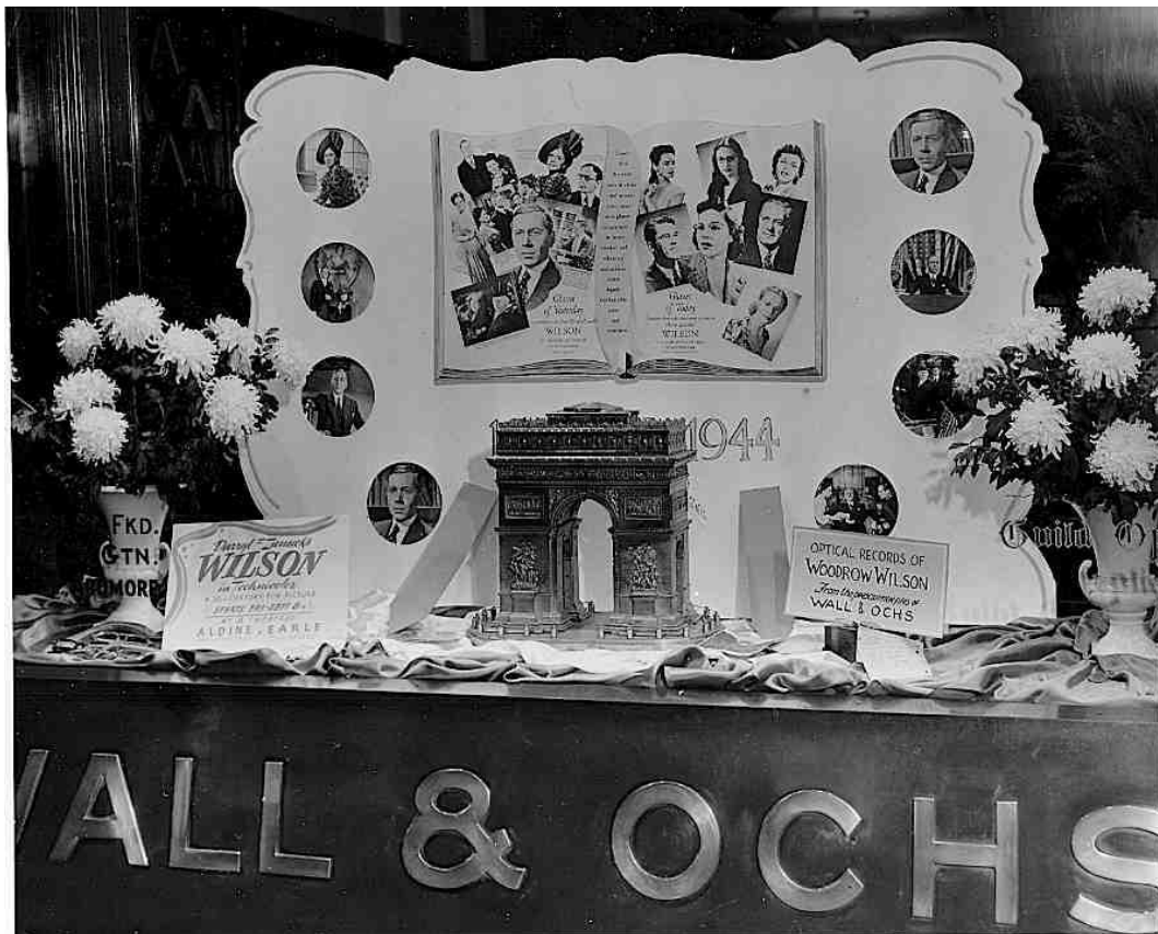
Window display promoting the release of 20 th Century-Fox's political biopic Wilson ; used with permission.