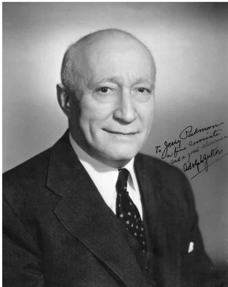
Paramount founder, Adolph Zukor; used with permission.