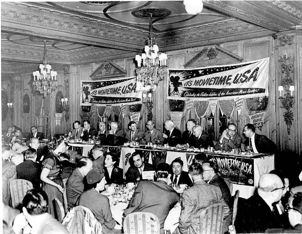
Distribution executives including Pickman (far right of top table) and exhibitors attend a conference in aid of a 1952 publicity drive; used with permission.