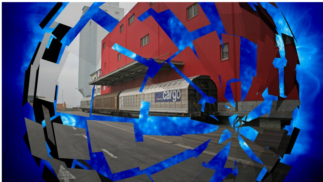
Fig 6. Playground: Playfully manipulating the sense of the “real”.

thus creating a different spatial framework. The experience of the real world through AR becomes part of another narration. The sense of the “real” and the sense of where one belongs to are playfully manipulated. The virtually created “second” frame of reference has its own coherent existence. It can be encountered in different places within the terrain. In addition to the terrain, the infrastructure of the park such as lamps, benches, and fences are part of the virtual model and altered in terms of scale, colour and shape. The scenario implementation balances out possible applications and interactions. At the stage of the experimental setting, user and staged terrain should be able to influence each other mutually (this part of our research is currently in progress). The user will interact with the scenario by walking around (altering position and walking pace) and looking around (altering view angle and orientation). The scenario will respond to the user by changing its appearance and character. For example, it will react to increasing or fading attention of the user (the duration of looking at something within one field of view) by growing its virtual extensions or reducing itself to a “normal” representation of the real; further, ground and virtual elements are distorted or enriched according to the user position. Playground orchestrates reality and virtuality by composing distance, forms, layers, motions and textures of the AR visualization.